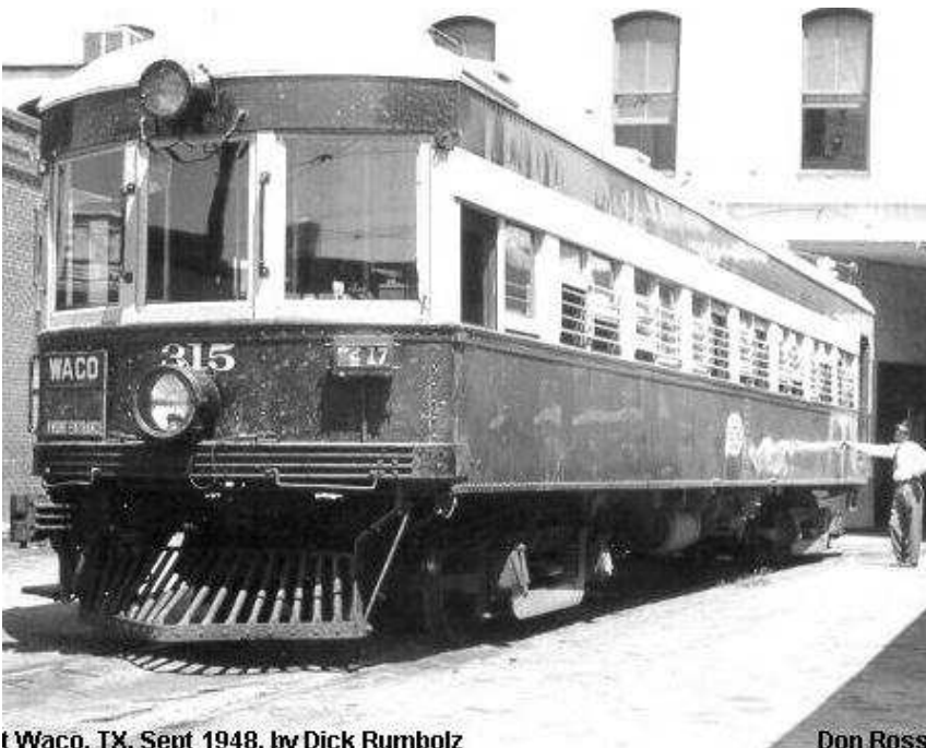
Waco, TX, Sept 1948, by Dick Rumbolz

"In addition to the deluxe splendors, even the humble local cars had smoking compartments forward, had padded leather bucket seats, and sported toilets (an indoor comfort a good many of their rural passengers had not seen before). The Texas Electric - longest interurban line in Texas - also had cars with railway post office sections with outside mail slots so that you could post a letter and have it delivered up and down the line that same day."